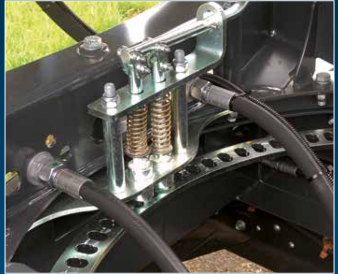
Infinitely adjustable turntable with mechanically releasable lock