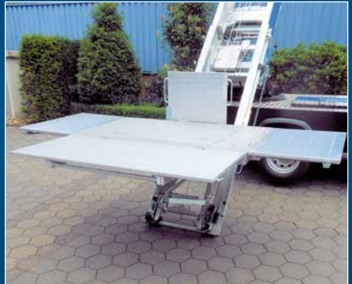
Large and flat loading surface on the platform