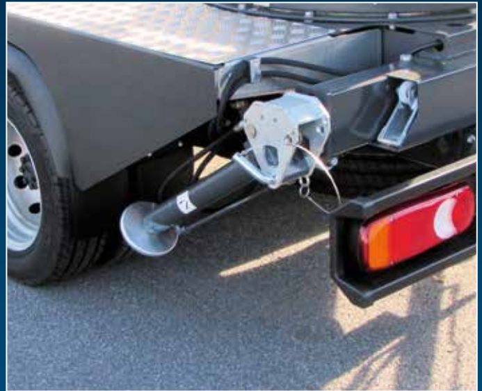
Hydraulic supports mechanically extendable and 60° swivelling