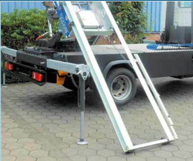
Ground level loading possible by infinitely adjustable pull-out lower extension of the platform