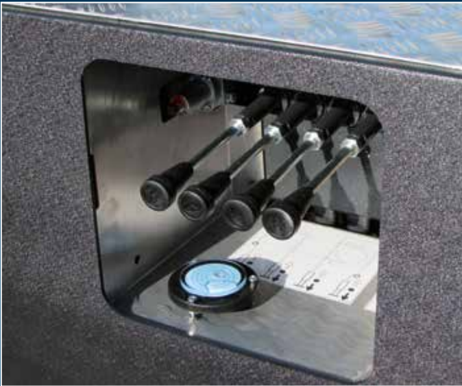
Control stand of hydraulic supports