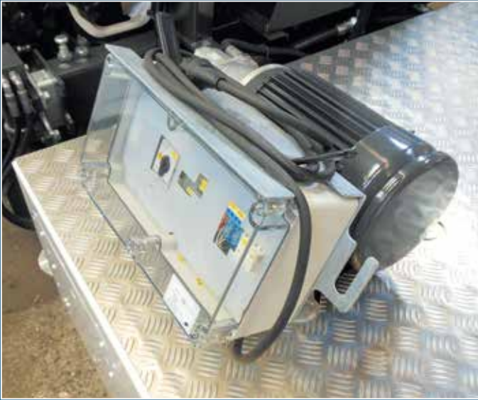
Additional 230 volt electric motor (optional)