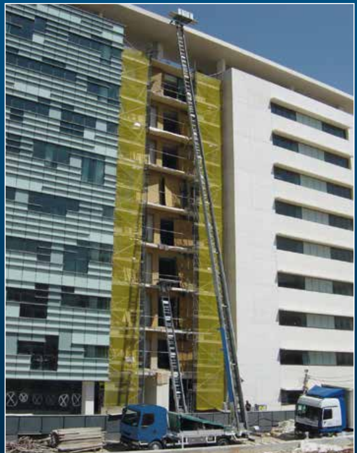
HL42 mounted on a 8,0 t carrier