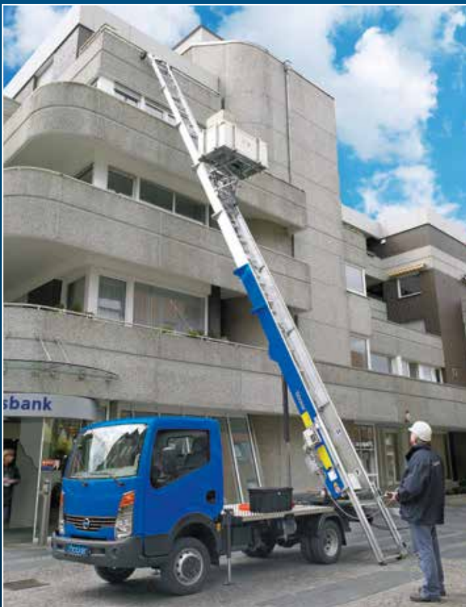
HL 26 mounted on a 3,5 t carrier