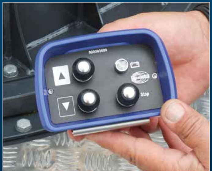
Optional mode by remote control