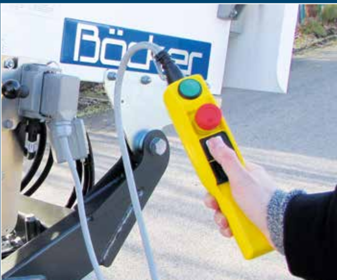
Operation below via operating buttons with 4 m cable