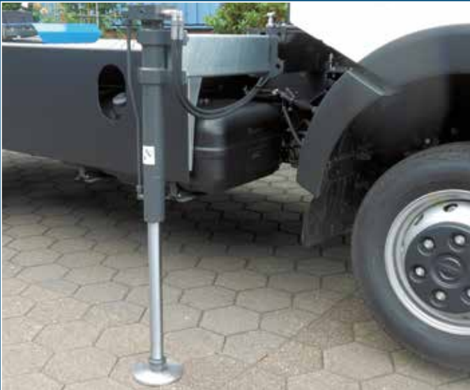
Optional front hydraulic supports pull-out